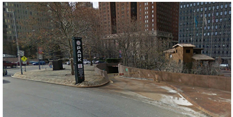
Parking garage entrance from the Sixth Street exit of the Veteran's Bridge.