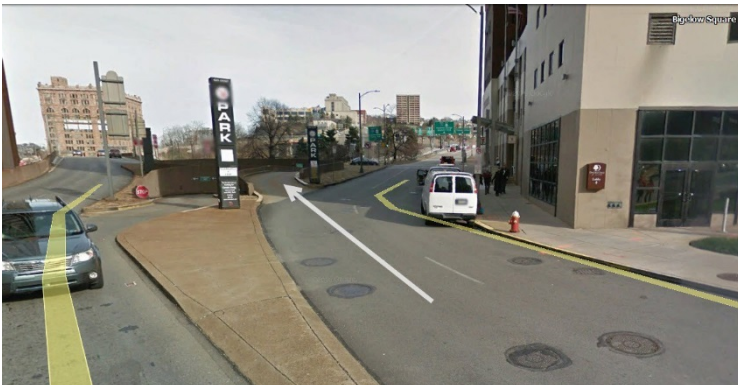
Parking garage entrance from Bigelow Boulevard.

*Alternate Route: Take the Grant Street Exit (on the left). Go a few blocks and make a right onto Sixth Avenue then first left onto Bigelow Boulevard/Ross Street. Entrance to garage is immediately on the left.